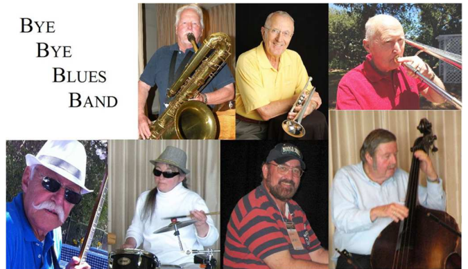
BYE BYE BLUES BAND