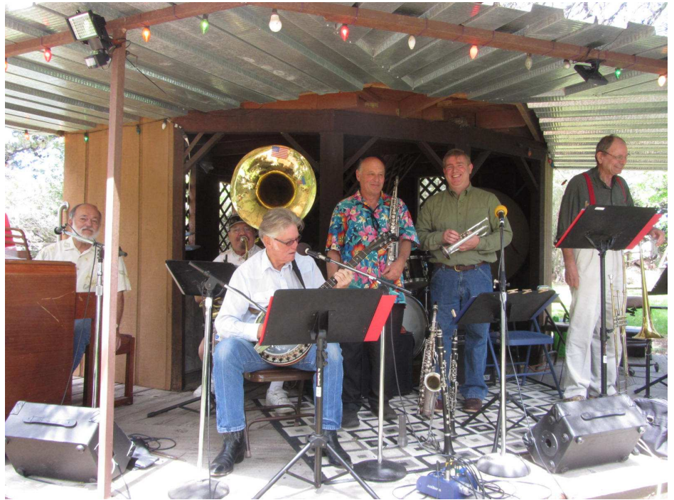
Clam Chowder at the 2014 BBQ