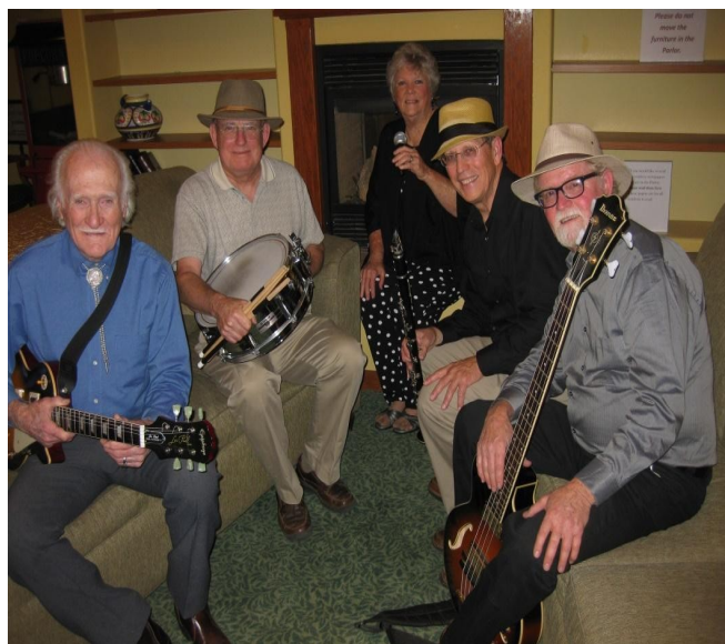
The Amigos Swing & Jazz Band

The Ulysses Jasz Band from Santa Barbara and The Amigos Swing and Jazz Band from the Central Coast will be playing “Hot Swingin’ Jazz” at the Basin Street Regulars’ Sunday afternoon Concert 1:00 to 4:30 on November 19th. Jam session starts at 11:00 (bring your instrument and join in). For more info call (805) 481-7840 or go to www.pismojazz.com .