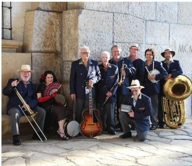
Ulysses Jasz Band