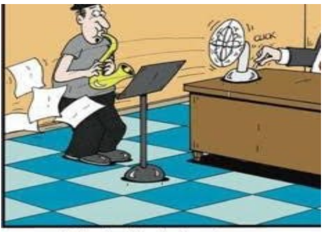
Introduction to jazz improv

So what's a Busk Session like? Busks are a new feature to this year's festival. And they are still going on. I can provide an "Insider's Viewpoint," based our Basin Street Irregulars set on Oct. 21 at the Branch Street Deli. The location was outdoors & the windy conditions blew many a music sheet at random times. Yet, the music played on b/ci in a busk session, the focus on improvisation, a staple of trad jazz. I am reminded of a comic strip: