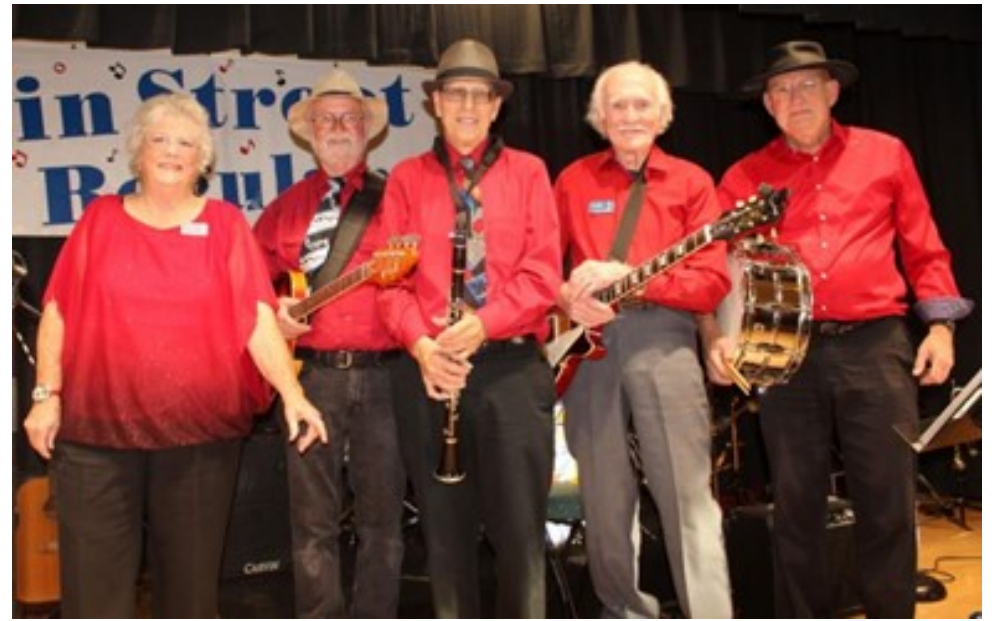
Amigos Swing and Jazz Band