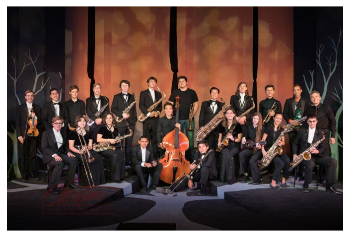
Santa Ynez High School Jazz Band