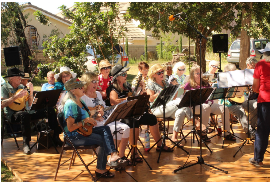
Oasis Ukulele Band