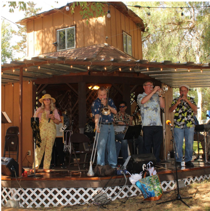
Creole Syncopators

The BBQ was a great success; we had a very large crowd. The day started out with our normal jam session with songs like Pennies from Heaven , Ice Cream , and I'm Gonna Sit Right Down and Write Myself a Letter . Creole Syncopators played