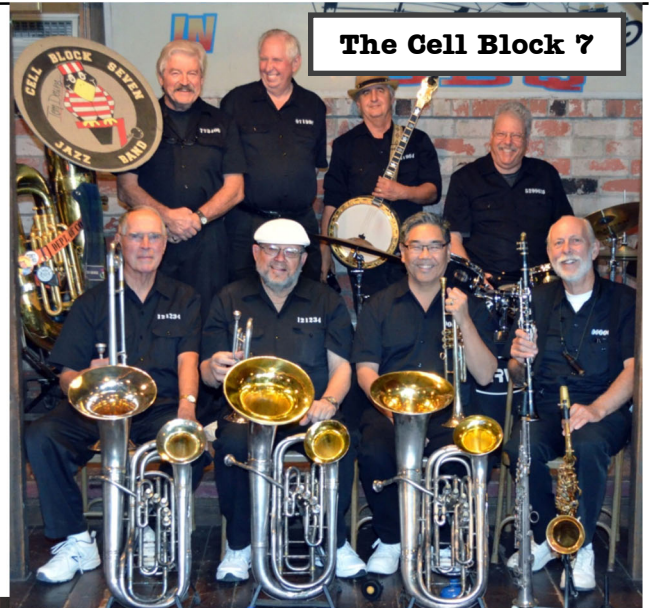
The Cell Block 7