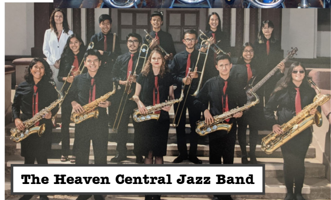
The Heaven Central Jazz Band