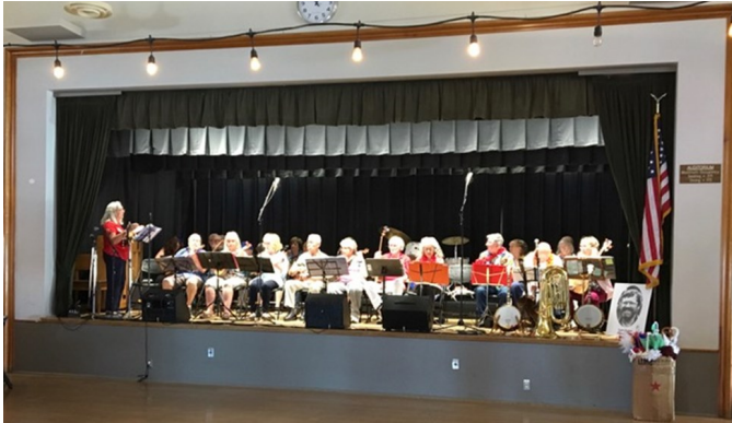
The Oasis Ukulele Band

If you want more information contact Bev Pritchett at: twobirds2@verizon.net .