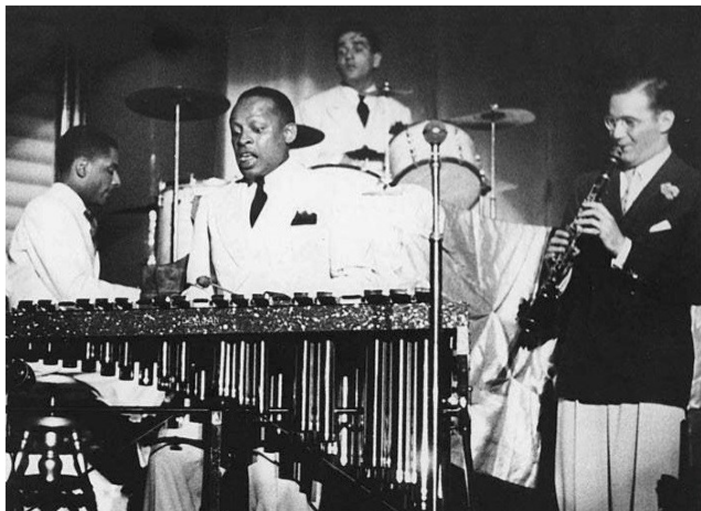
Benny Goodman and his Band circa 1937, New York

https://bunnyberiganmrtrumpet.com/2020/11/20/palomar-nights-summer-1935-with-benny-goodman-basin-street-blues/