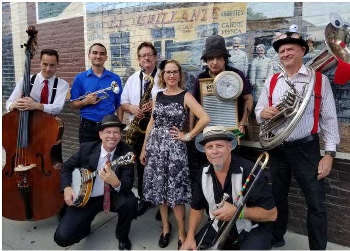
The Barrelhouse Wailers

The Barrelhouse Wailers serve up their own take on Prohibition Era hot jazz and blues music of the 1920's and 1930's. They perform on only acoustic instruments to retain the authentic sound of that period. The Wailers bring their passion and energy to the style, making it as fresh today as it was when it was the newest, hottest dance music 100 years ago! This eclectic crew really entertains with a whole lot of jazz, a pinch of blues, and a bayou full of New Orleans swagger. They have been influenced by a cocktail of artists, past and present, like Bessie Smith, Ella Fitzgerald, Preservation Hall Jazz Band, Tuba Skinny, Sydney Bechet, Billie Holiday as well as Traditional New Orleans Jazz, Classic Blues, Country Blues and Big Band sounds.