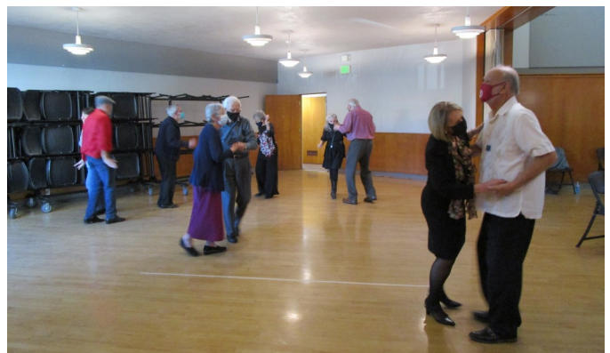
Dancing at January's Show back in the Vet's Hall

Masking is no longer a State or County requirement for fully vaccinated individuals. If you are not vaccinated or you just want a little extra protection, face masks are still appropriate and appreciated. Thank you.