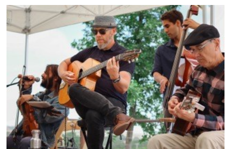
Big Sirs of Swing

Donations will be accepted on-line during this event. Feel free to leave donations at www.paypal.me/basinstreetregulars