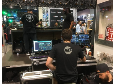
A Serious Live Streaming Setup

hall. There were so many events listed on the website, it was hard to scroll through them all and see what you wanted to do. We checked the schedule Friday evening on my laptop so that we would have a better idea of what to see on Saturday.