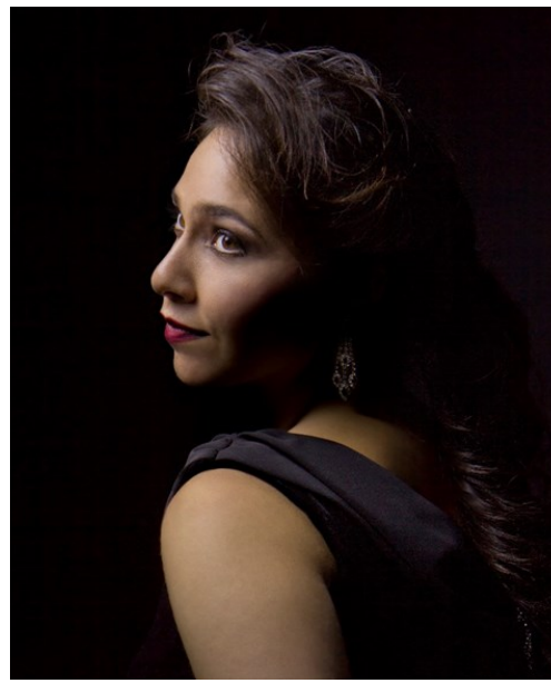
Continued on page 2

This show will also be broadcast on our Facebook