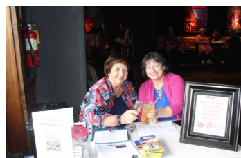
Photos from Harry's Night Club & Beach Bar, June 25